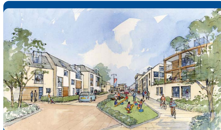
Artist's impression of a new housing area in the town centre

If you want to see the entire masterplan document, and comment on it in more detail, copies and forms are available to view at the Customer Service Point in the Concourse Shopping Centre, the Ecumenical Centre, Skelmersdale Library, local Post Offices and the Council Offices on Derby Street, Ormskirk. Alternatively, visit www.westlancsdc.gov.uk/skelmersdale to view the masterplan and make your comments online.