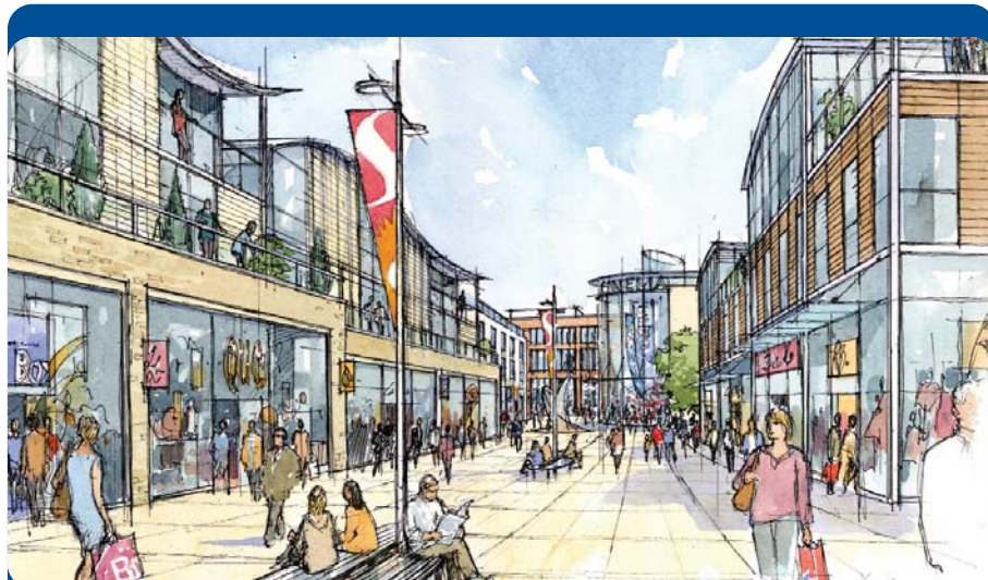
Artist's impression of the new high street