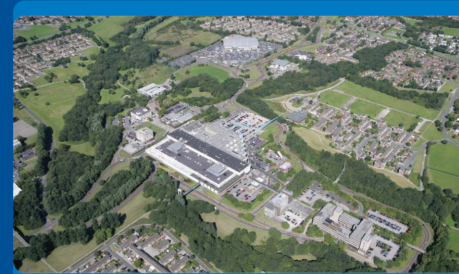
Aerial view of Skelmersdale town centre

But there is still the opportunity for everyone in the community to make comments and shape the future regeneration of the town centre, and we would welcome your views on the proposals outlined below: