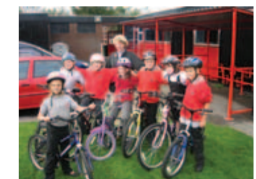
Cyclists from Little Digmaor School

Children love cycling so why not let them cycle to school, or if they are younger cycle with them.